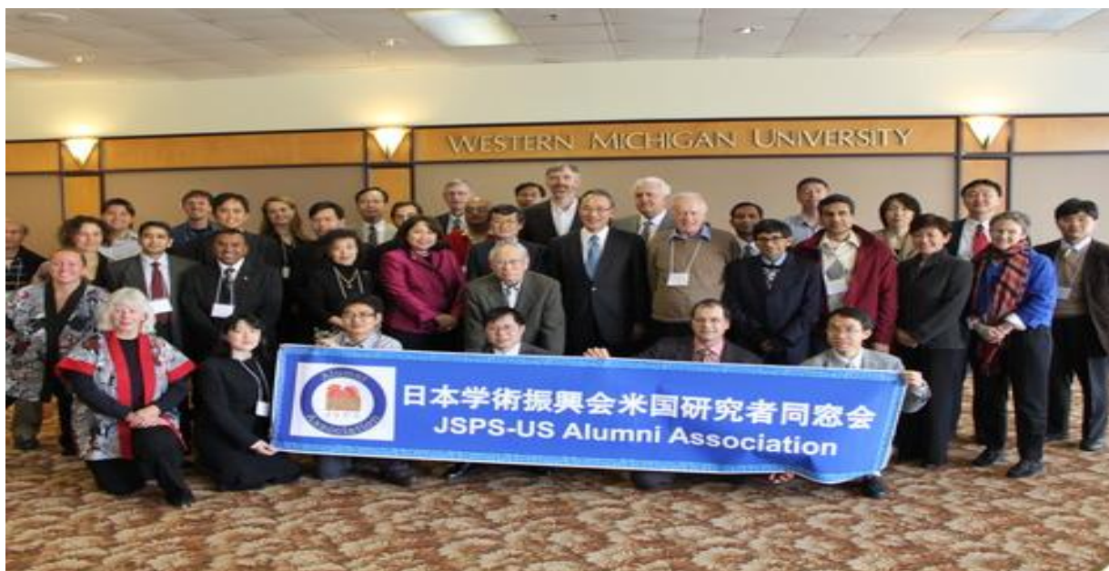
JSPS US Alumni Association group photo